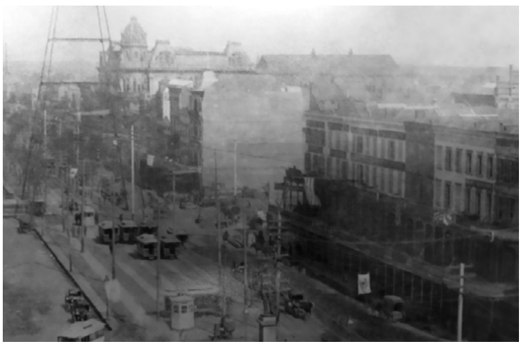
This scene captures the gaping hole in the 100 block of Bourbon Street caused by the 1892 fire.

One person's disaster, the adage goes, is another person's opportunity. Owners of the burned